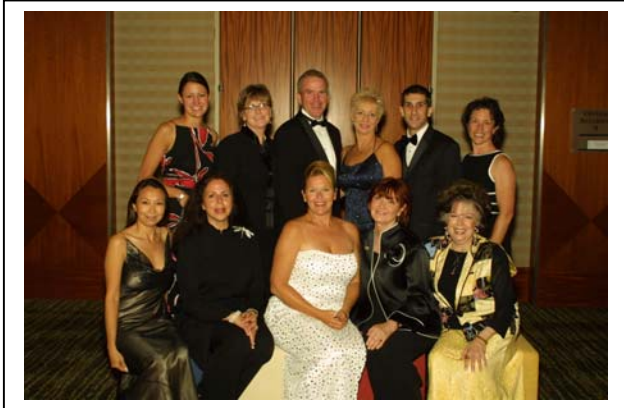
Eventworld 2004 Conference Committee Members take pause to pose at the Esprit Gala.

Make sure you mark your calendars and "save the date" for Eventworld 2005 scheduled for August 11-13, 2005. The Renaissance Hollywood Hotel will be opening their doors and the committee promises yet another educational and networking opportunity for ISES members and guests to look forward to in the coming year.