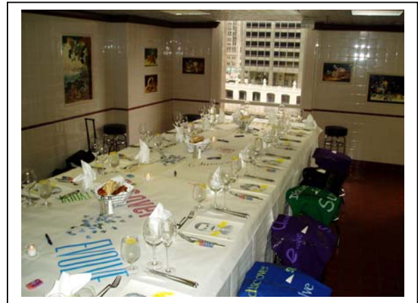
Collaborative creativity was a key element to the success of Eventworld 2004. Designers and suppliers from a myriad of disciplines all tossed in their ideas to come up with the best ideas!